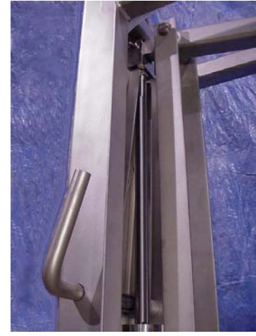
Fig. 3 Safety Lock linkage