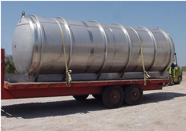
Vacuum Vessel with Reinforcing Rings