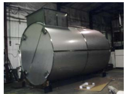
Insulated Tank with Alcove