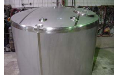
2500 Gallon Single Wall Tank