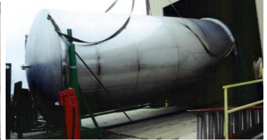
Insulated Double Wall Vessel with Floor Mount