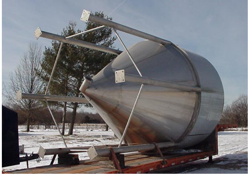
12' Diameter x 25' High Cone Bottom Hopper on Semi-Trailer