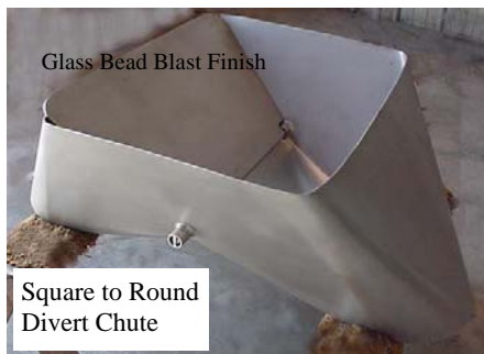
Glass Bead Blast Finish