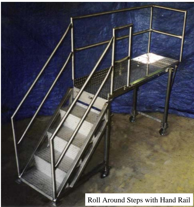
Roll Around Steps with Hand Rail