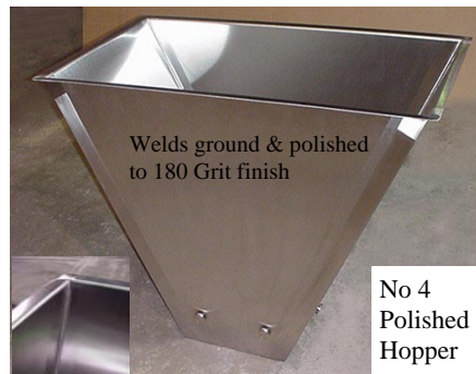
Welds ground & polished to 180 Grit finish