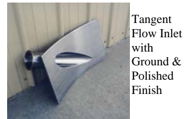
Tangent Flow Inlet with Ground & Polished Finish