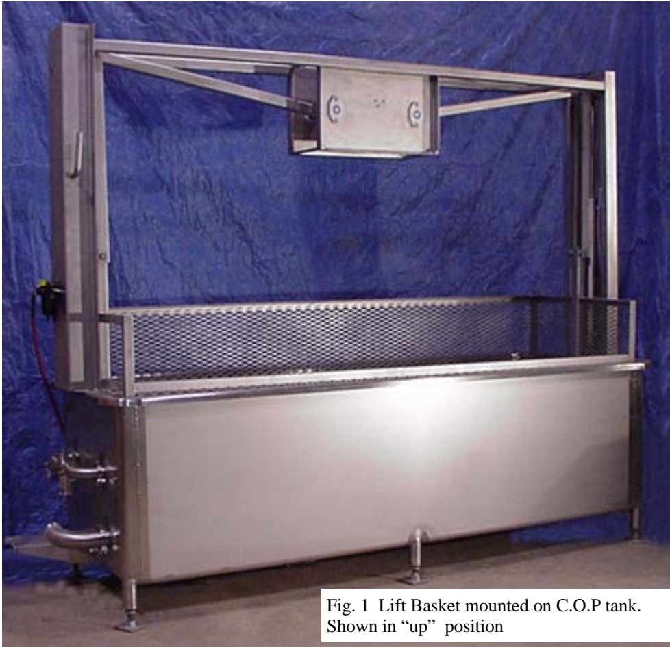
Fig. 1 Lift Basket mounted on C.O.P tank. Shown in “up” position