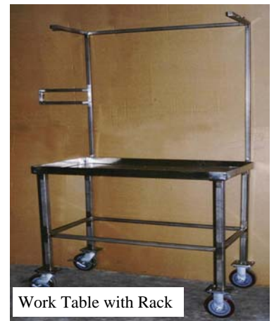
Work Table with Rack