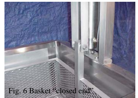
Fig. 6 Basket “closed end”