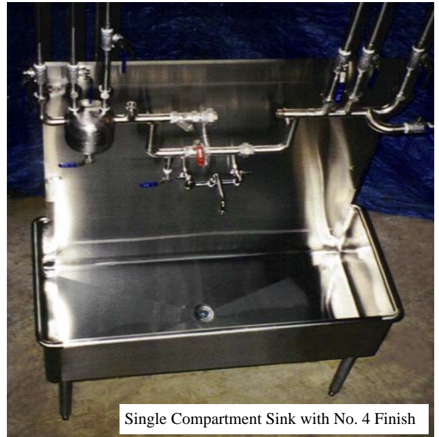
Single Compartment Sink with No. 4 Finish

Stainless Steel Limited can fabricate almost anything you might need that is not readily available off the shelf. These items can give you a competitive advantage by fine tuning your production line to your specific needs. The photos shown are only a sample of our capabilities. Let us quote (or build) something for you today!