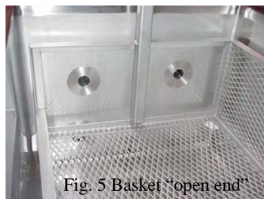
Fig. 5 Basket “open end”