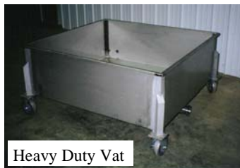
Heavy Duty Vat