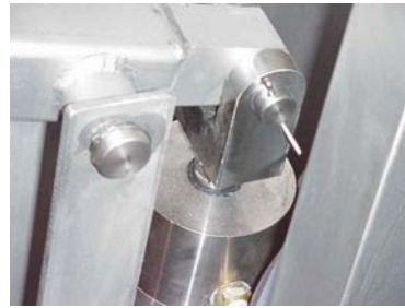
Fig 2. Lift Cylinder / linkage