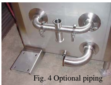
Fig. 4 Optional piping