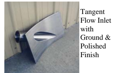
Tangent Flow Inlet with Ground & Polished Finish