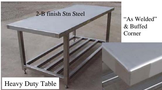
Heavy Duty Table