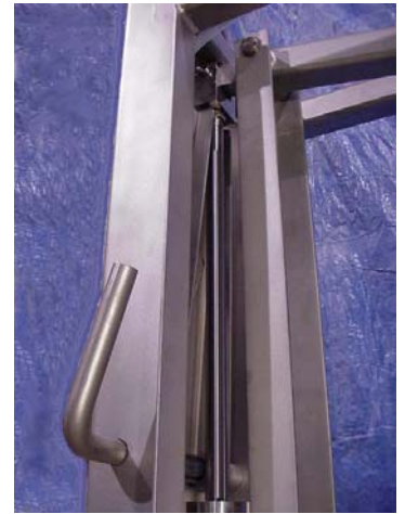
Fig. 3 Safety Lock linkage