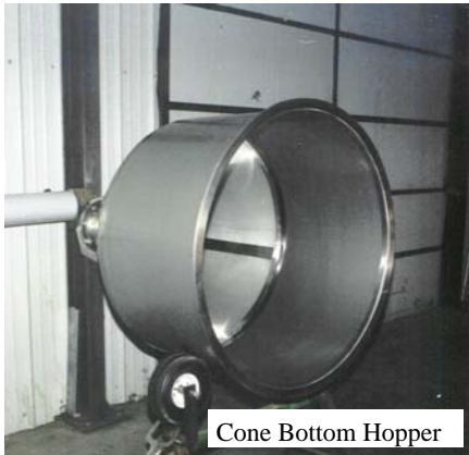
Cone Bottom Hopper