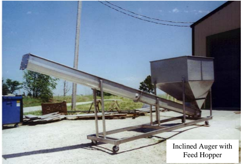
Inclined Auger with Feed Hopper