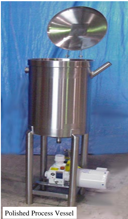
Polished Process Vessel

NOTE: We can give you a combination of Blasted finish on the outside and polished on the inside.