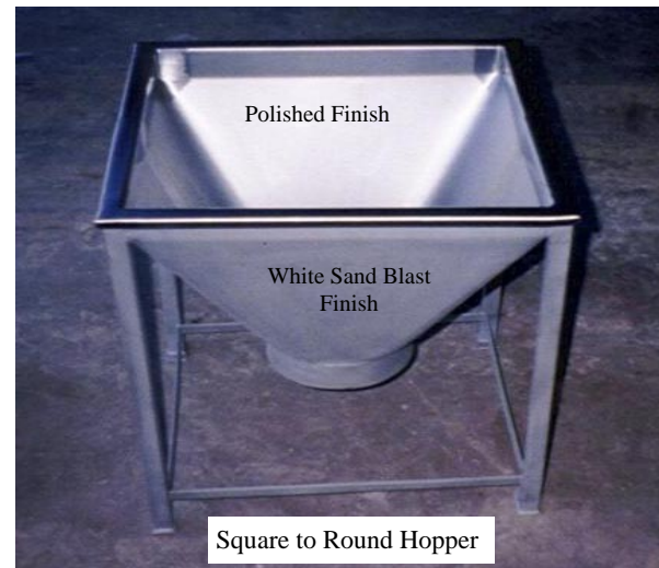
Square to Round Hopper

NOTE: We can give you a combination of Blasted finish on the outside and polished on the inside.